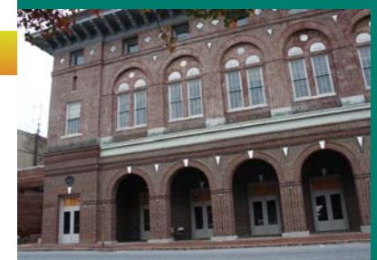
Left: The Old City Auditorium at 1112 Main Street is just one of three buildings that have benefited in 2009 from the Lynch's Landing Facade Grant Program. Grants are awarded annually through a competitive application process to those who are renovating their downtown buildings. Other grants this year were awarded to the L. Oppleman building and The Parlor Lofts.